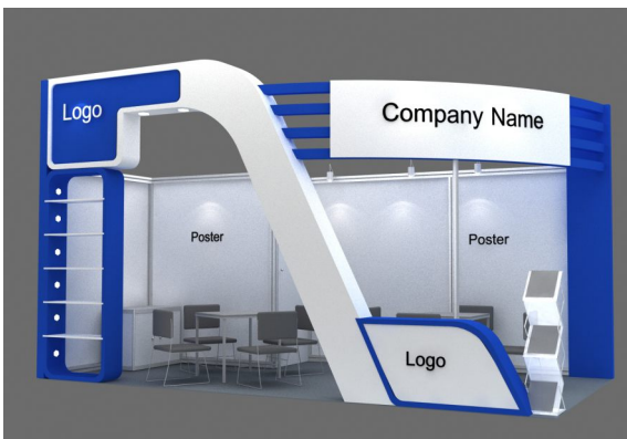
Design-4 - EUR 150/m 2