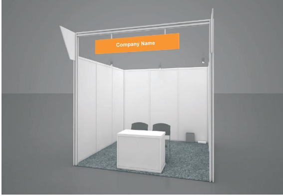
Design-1 - EUR 42/m 2