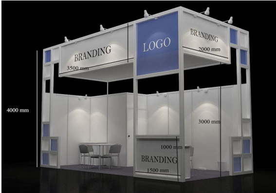
Design-3 - EUR 90/m 2