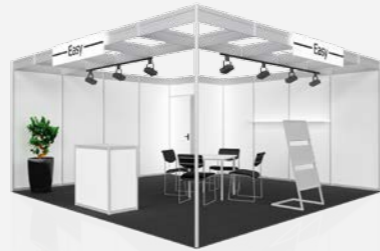
EASY from 52,00 €/m 2 Configurable online

You can configure and order these and over 100 more booth types directly online.