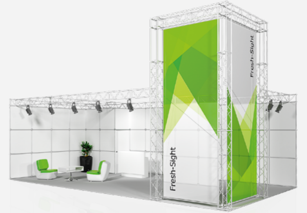
FRESH SIGHT from 108,40 €/m 2 Configurable online