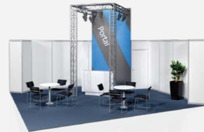
PORTAL from 105,90 €/m 2 Configurable online