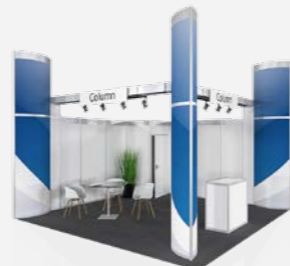
COLUMN from 78,20 €/m 2 Configurable online