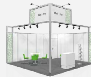
MAXI PRO from 78,20 €/m 2 Configurable online