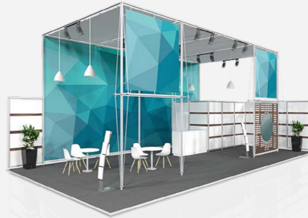
ALPHA from 259,00 €/m 2 Configurable online