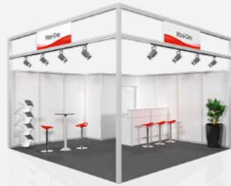
MAXI ONE from 56,00 €/m 2 Configurable online