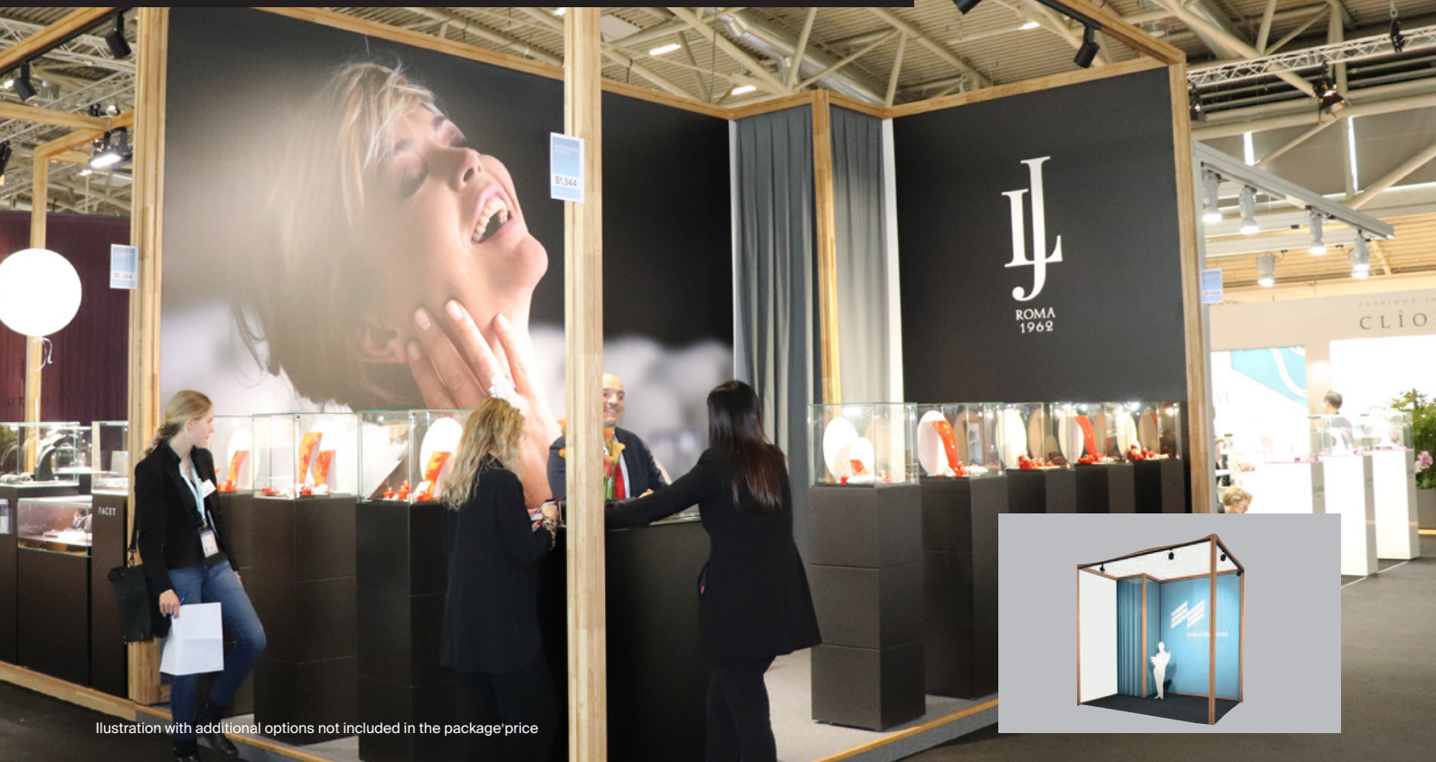
Illustration with additional options not included in the package price