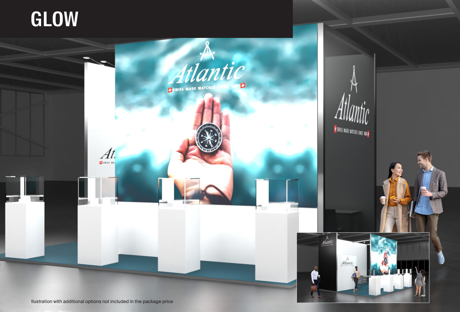
Illustration with additional options not included in the package price