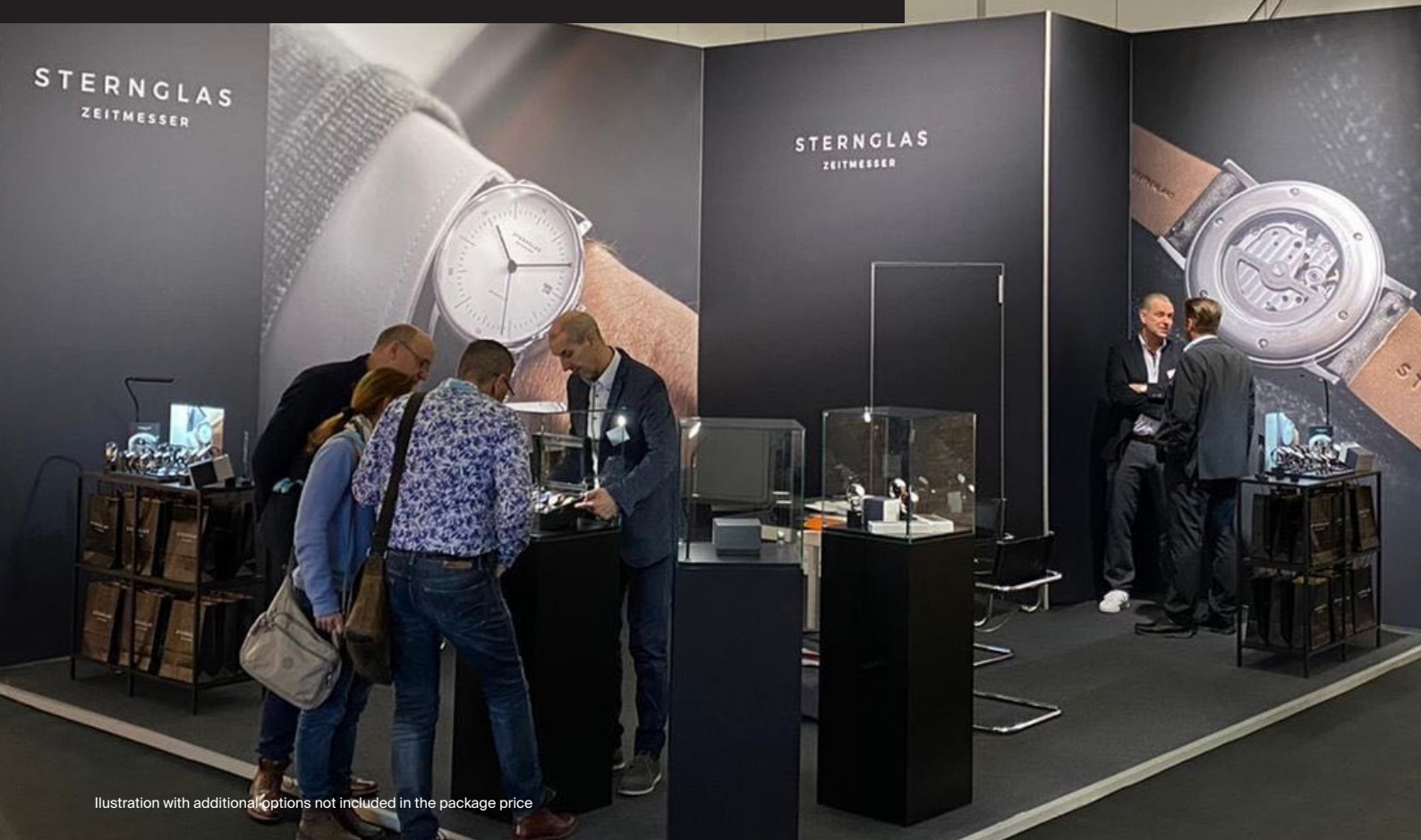
Illustration with additional options not included in the package price