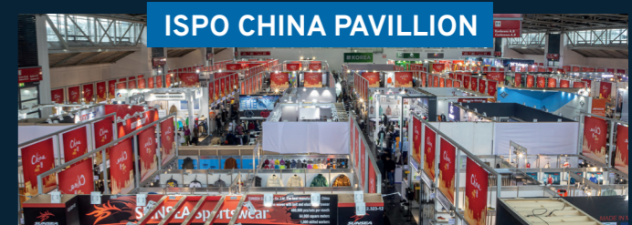
ISPO CHINA PAVILLION