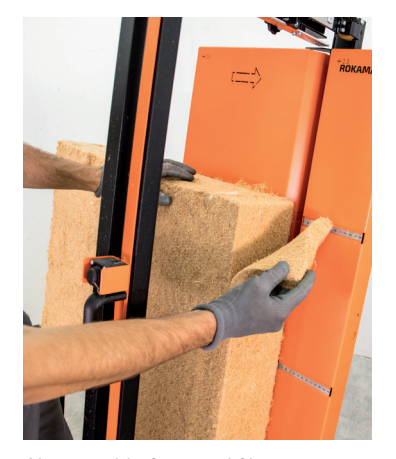
Also suitable for wood fibre insulation boards (optional)