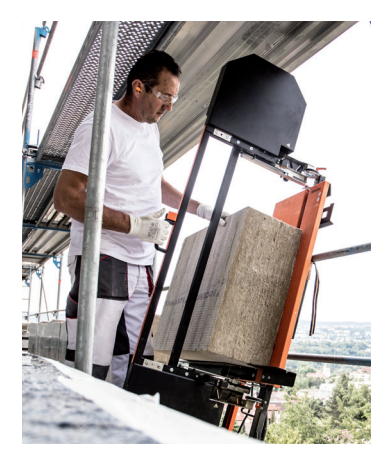
Easy to use