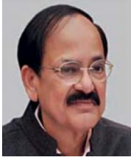
एम. वेकैया नायडु M. VENKAIAH NAIDU