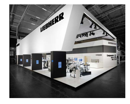
Design : Budget-driven stand design with your corporate identity

Individual System: The perfect combination of system and design