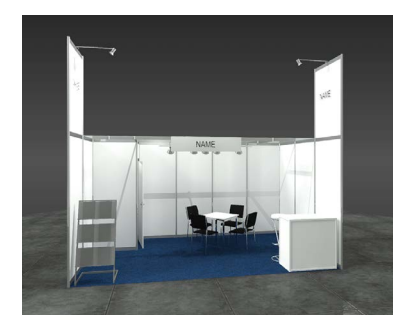
Row stand: EUR 8,700<sup>*</sup> (20 m<sup>2</sup>)

With meplan as your stand construction partner, the choice is yours.